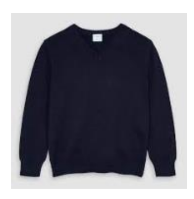
Plain navy jumper