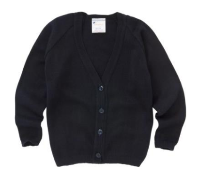
Plain navy cardigan