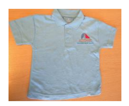
Pale blue polo shirt with school logo