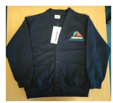
Navy cardigan with school logo