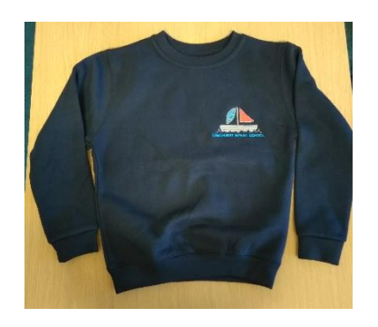
Navy jumper with school logo